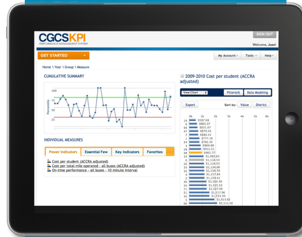
Android, iPad, and tablet device friendly

Use CGCS KPI on your tablet device, including the iPad. This is the perfect option to access the system in meetings or on the go. Available 24/7 through your internet or mobile connection.